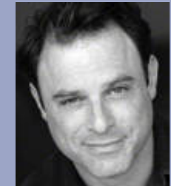
Anthony Crane Photo Added